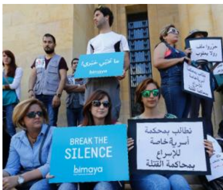
Lebanese activists protest in Beirut, on May 30, 2015, calling for an end to domestic violence and t ...

... one of the most significant predictors of